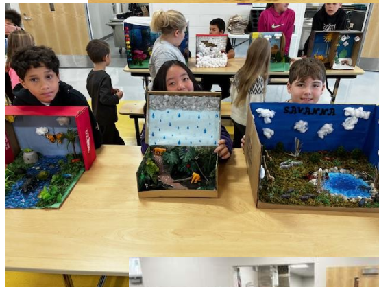
5th Grade Biome Projects