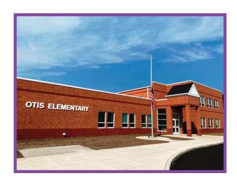
718 N. Brush St.