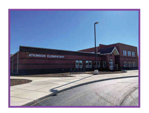
1100 Delaware Ave