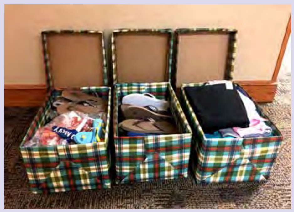
A Warm Feeling From Giving

FCS District Office donated sweat shirts, sweat pants, gloves and flip flops to the Liberty Center. They also donated $300 to help with daily costs.