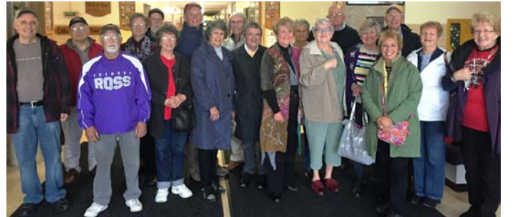
Members of the Class of 1960 toured Ross High School and Fremont Middle School on October 3rd.